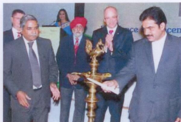
Inaugural ceremony on 2nd February 2012

The speakers emphasized the importance of a common platform for the stakeholders in the Indian power sector in order to improve reliability & efficiency of power sector. The EEC as an institution with nationwide reach shall tackle common problems such coal quality, renovation & modernization, efficient use of fuel, training of personnel and access to foreign technical know how.