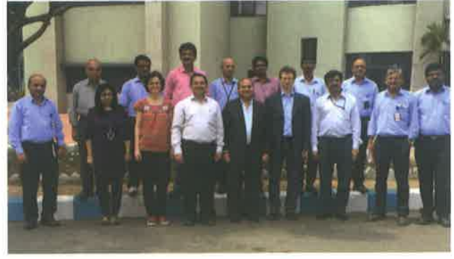
German Expert Team at NTPC Dadri & Simhadri Power Stations during Flexibilisation Study